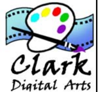
Photo Restoration & Retouching, Artistic Imaging, Desktop Publishing and Web Design

Do you have photos that need to be retouched, restored or colorized? Do you have precious family photos on your wall that are faded or torn? If so, contact us! We can restore your photos to look like new!