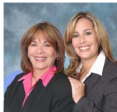
Hiddenbrooke Resident Since 2000